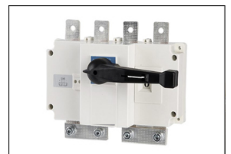
DC DISCONNECT SWITCHGEAR