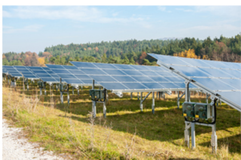
PV STRING PROTECTION