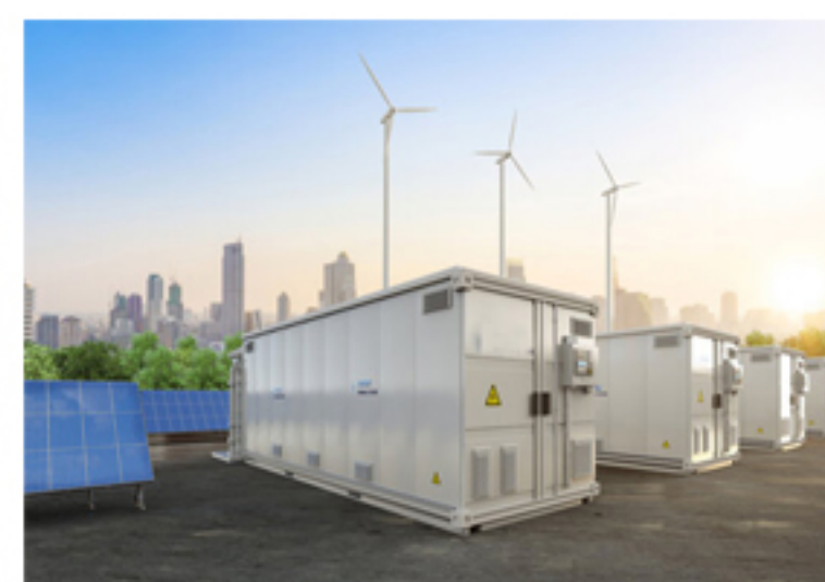
BATTERY PACKS / STORAGE SYSTEMS