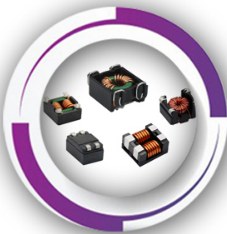
COMMON MODE CHOKE