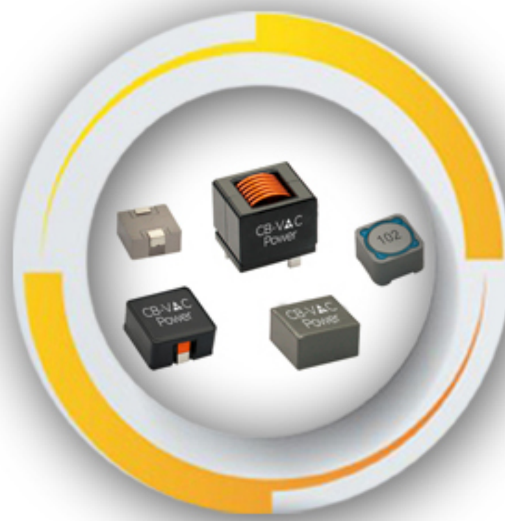
AEC-Q COMPLIANT PRODUCTS